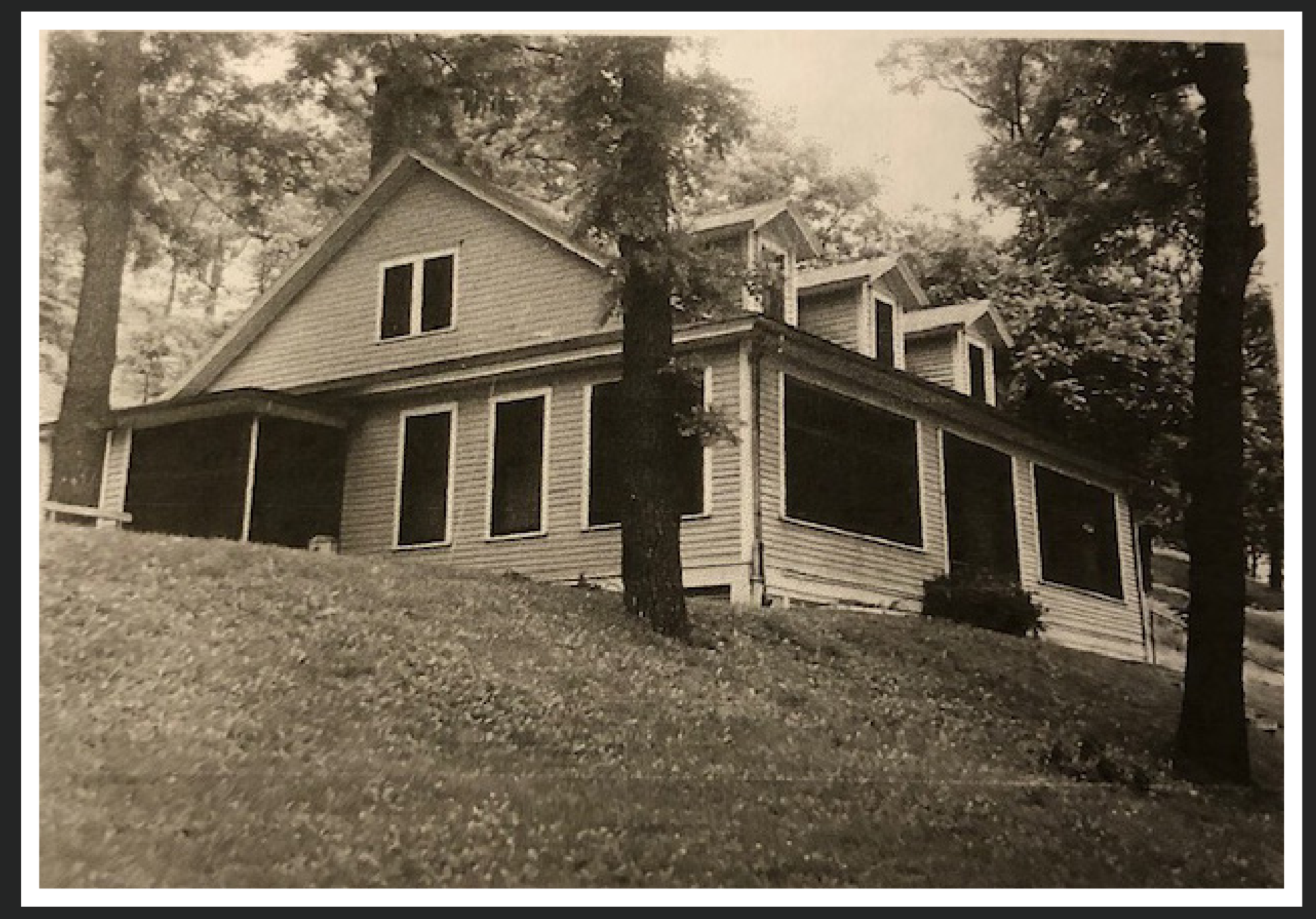
Overview of Director's Cottage in 1941, facing northeast.